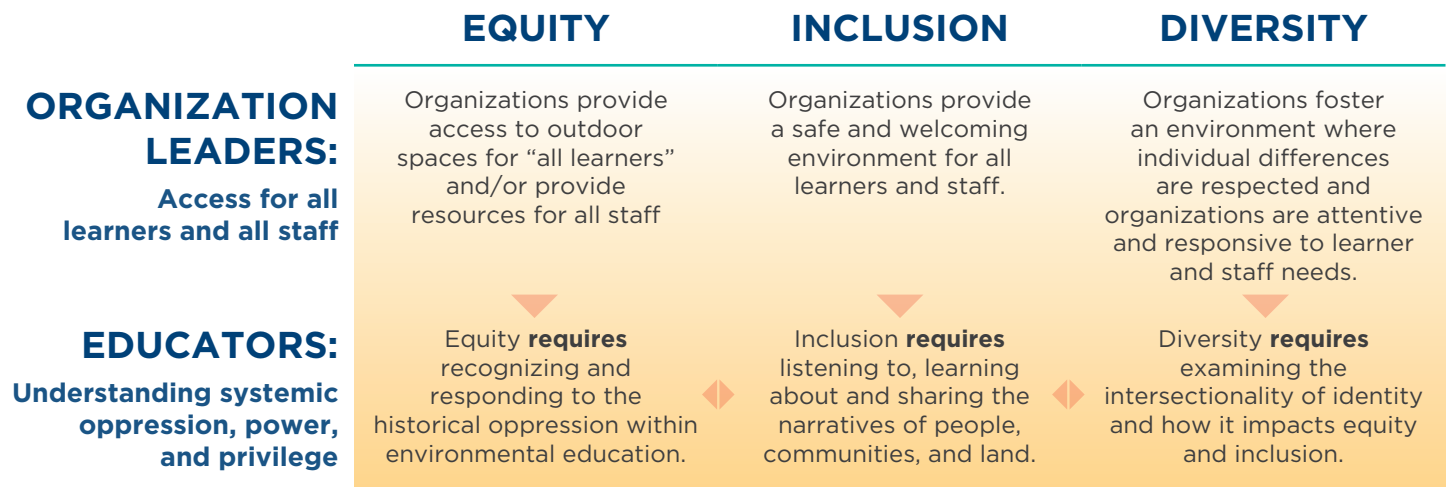
Figure 2. Organization leader and educator definitions of equity, inclusion, and diversity.

Like the educators, researchers have challenged the tendency of organization leaders to focus on access for all , which neglects the critical need to understand how systemic oppression, power, and privilege have disproportionately impacted marginalized communities, particularly people of color (Feinstein & Meshoulam, 2013; Herrenkohl & Bevan, 2017; Philip & Azevedo, 2017). This “access-for-all” narrative negates the need to prioritize these communities that have been, and continue to be, largely excluded in EE. Therefore, pushing beyond access to consider the systemic barriers that inform inequities becomes a necessity.